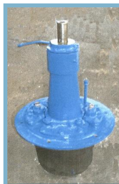
Refurbished Water Cooled Roof Fan Unit