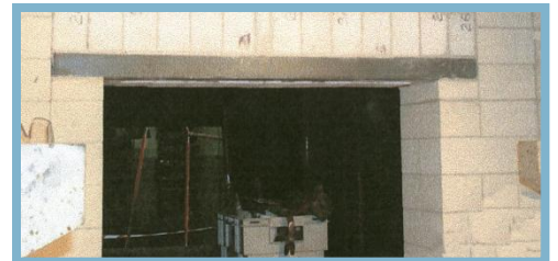
Silicon Carbide Arch Lintel Installation