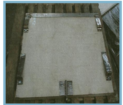
Sealed Quench Vestibule Door